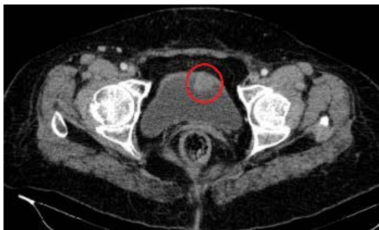
Figure 1. CT view of the intraluminal polypoidal enhancing mass projecting into the bladder lumen